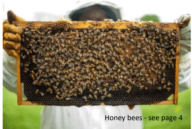
Honey bees - see page 4