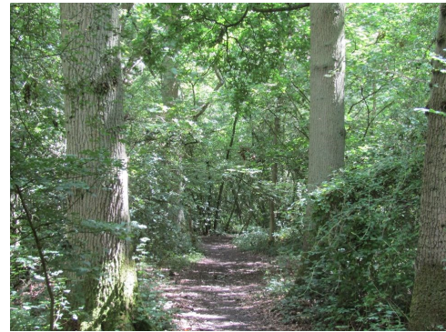
Kempston Woods If you have any photos of Kempston or Biddenham, send them to stjameschurchbiddenham@gmail.com

Peter answered him, 'Lord, if it is you, command me to come to you on the water.' He said, 'Come.' So Peter got out of the boat, started walking on the water, and came towards Jesus. But when he noticed the strong wind, he became frightened, and beginning to sink, he cried out, 'Lord, save me!' Jesus immediately reached out his hand and caught him, saying to him, 'You of little faith, why did you doubt?' When they got into the boat, the wind ceased. And those in the boat worshipped him, saying, 'Truly you are the Son of God.'